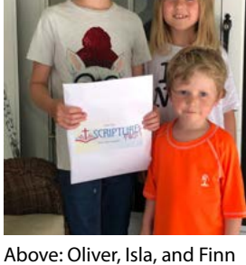
Van Ruler receive a Virtual Scripture First delivery.