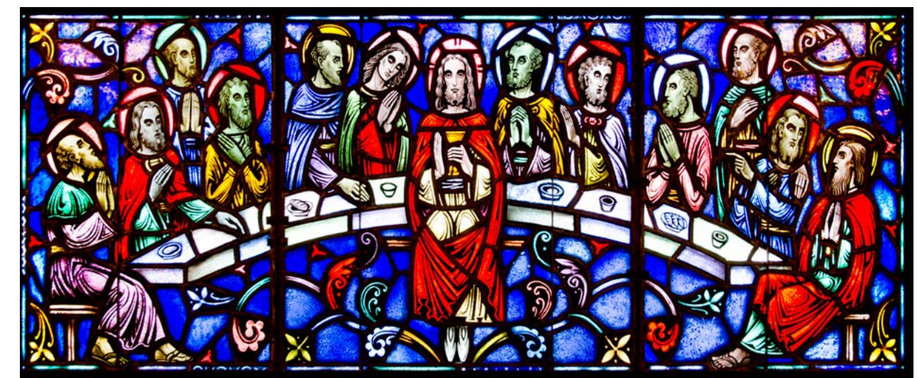
Transom window in First Lutheran Narthex