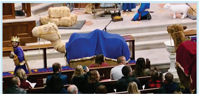
The kings and camels making their way from the back of the church to the front to see Jesus.