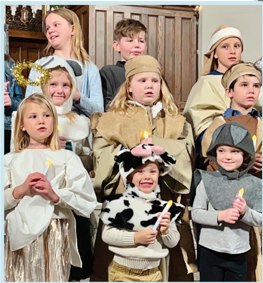
The show ended with everyone singing Silent Night in the candle light.