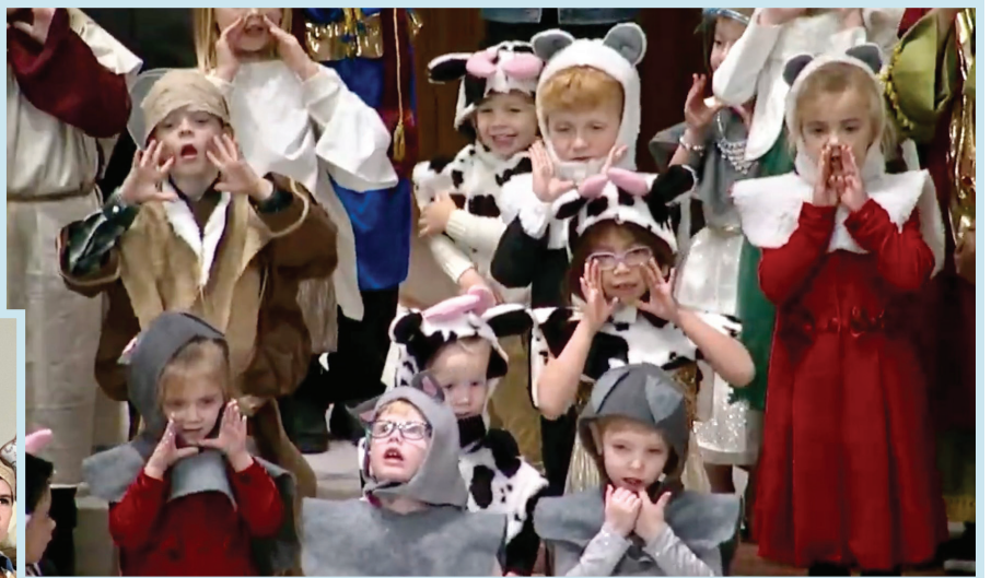
A shot of the group singing along to "Hark! The Herald Angels Sing."