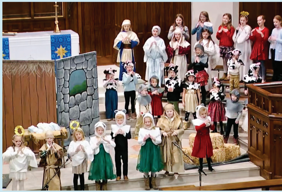
The 1st grade class leading "Go Tell it on the Mountain!" dressed as shepherds and sheep.