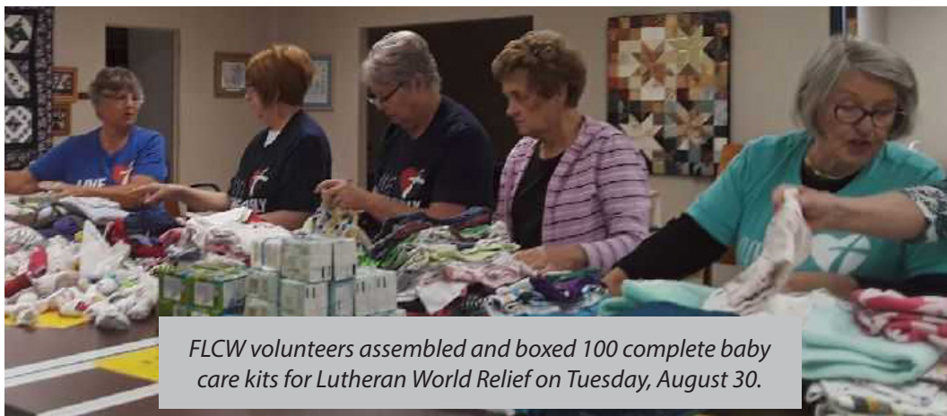
FLCW volunteers assembled and boxed 100 complete baby care kits for Lutheran World Relief on Tuesday, August 30.