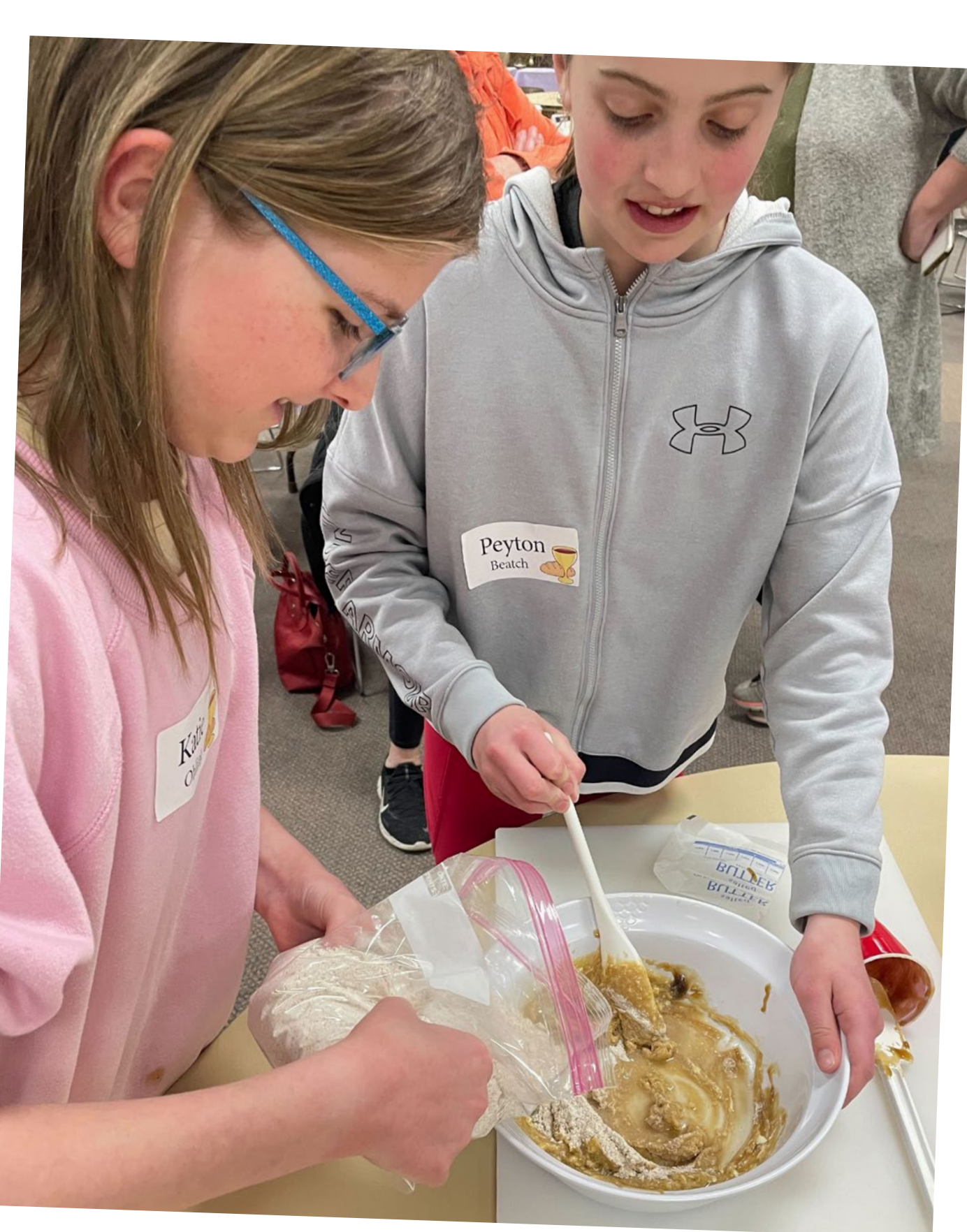
Students prep the bread for Maundy Thursday communion.