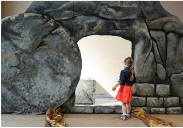
Photos: Children explore the empty tomb on Easter morning.