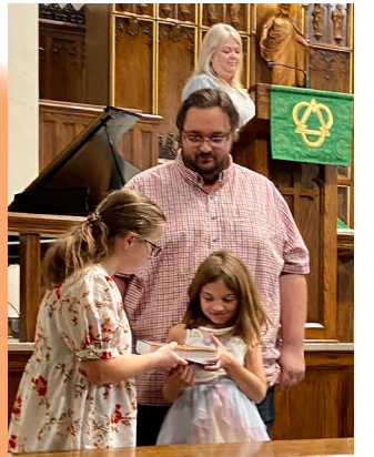
3rd Grade Bibles