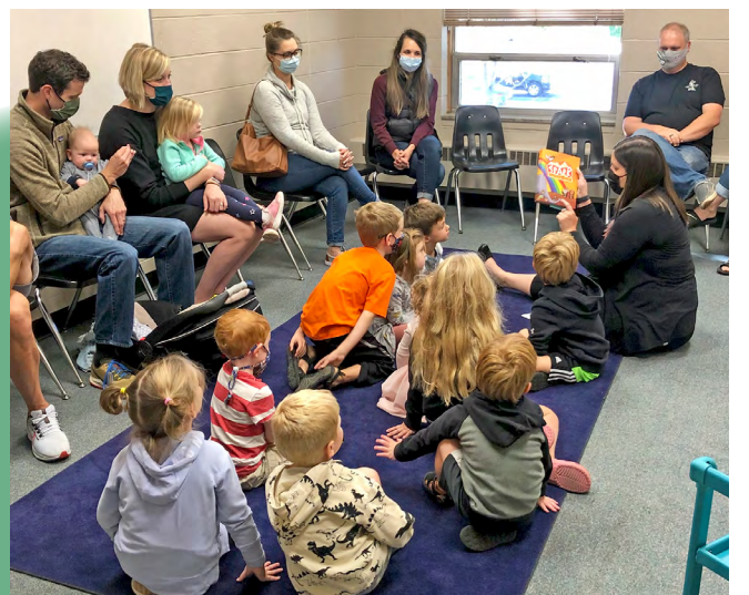
First Step 3 year olds