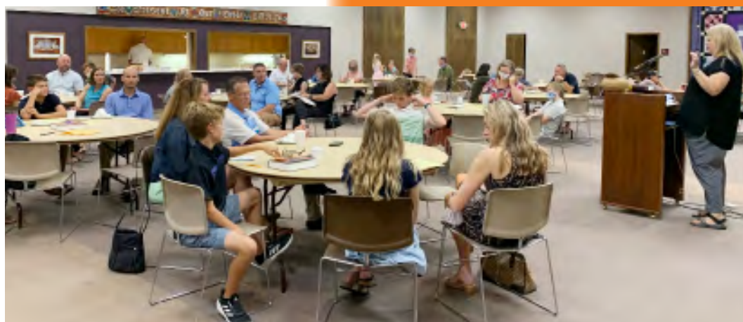
7th Grade Bibles