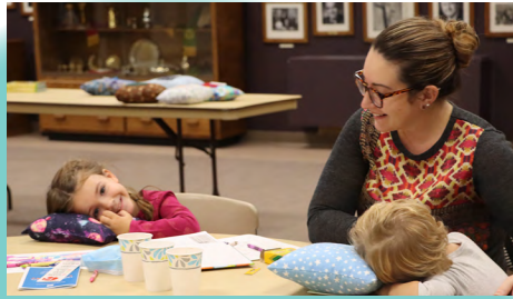
Prayer Pillows - 4 year olds