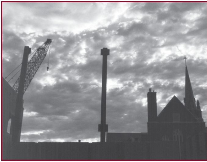
The continued building of First Lutheran campus, canopied entrance and annex addition. Photo courtesy of Ed Mansfield, Oct. 31, 2004.

Where we are. As of August 1, we're now back with offering "in-person" worship in our main sanctuary on Saturday nights at 5 p.m. and again on Sunday mornings at 8 a.m. (now live-streamed, archived on YouTube, as well as our usual broadcasts and telecasts). Small groups are also gathering back on campus (e.g. Quilters, Volunteers, Pr. Dave's Bible Study, etc.), and we've had an excellent response to