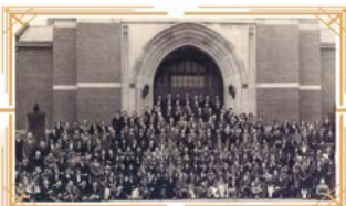
God's Grace: Our Heritage and Future First Lutheran Church 100th Anniversary Capital Campaign

to come in for repayment of the HVAC loan each month is a blessing indeed from God. I am reminded of the following Bible verse when I think of these continuing gifts: "Every generous act of giving, with every perfect gift, is from above. Coming down from the Father of lights, with whom there is no variation or shadow due to change." —James 1:17 NSRV